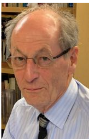
Sir Michael Marmot