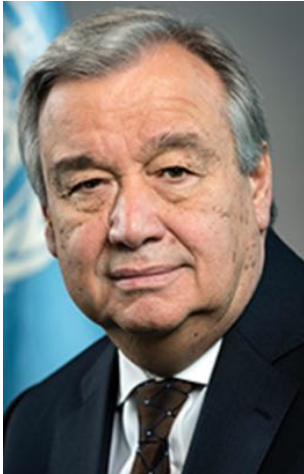
António Guterres UNITED NATIONS SECRETARY GENERAL

António Guterres, the ninth Secretary-General of the United Nations, took office on 1st January 2017. Having witnessed the suffering of the most vulnerable people on earth, in refugee camps and in war zones, the Secretary-General is determined to make human dignity the core of his work, and to serve as a peace broker, a bridge-builder and a promoter of reform and innovation.