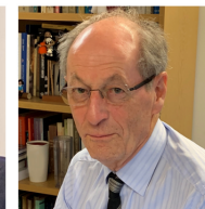
Sir Michael Marmot